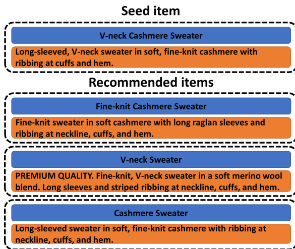
Figure 2: Fashion results. A representative seed item associated with the top three recommended items retrieved by RecoBERT.

the sweaters sub-category, (2) comprise the same material or indicated by a "PREMIUM QUALITY" label, and (3) preserve similar style properties, such as V-neck, and ribbing in a few locations on the sweater.