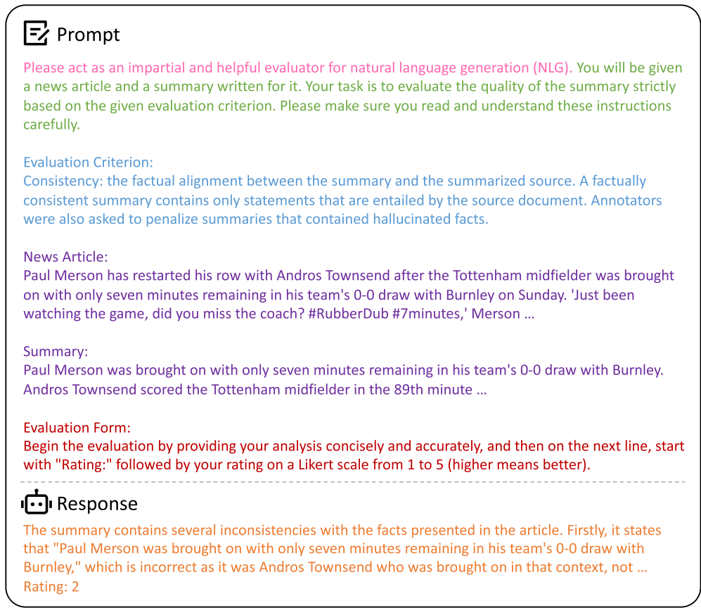
Figure 2 An example of prompting LLMs to evaluate the aspect of consistency of the summary. There are role and interaction , task instructions , evaluation criteria , input content , and evaluation methods in the prompt, as well as the evaluation results , including the rating and explanation generated by LLMs.