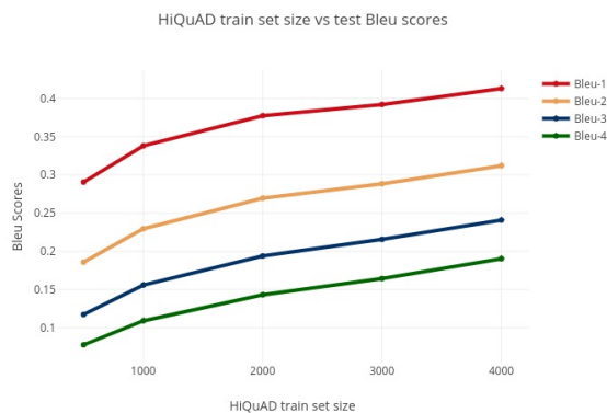
Figure 6: Trade-off between HiQuAD training dataset size and BLEU scores.

To demonstrate the improvement in Hindi QG from the relatively larger English SQuAD dataset, we show results of using only HiQuAD during the