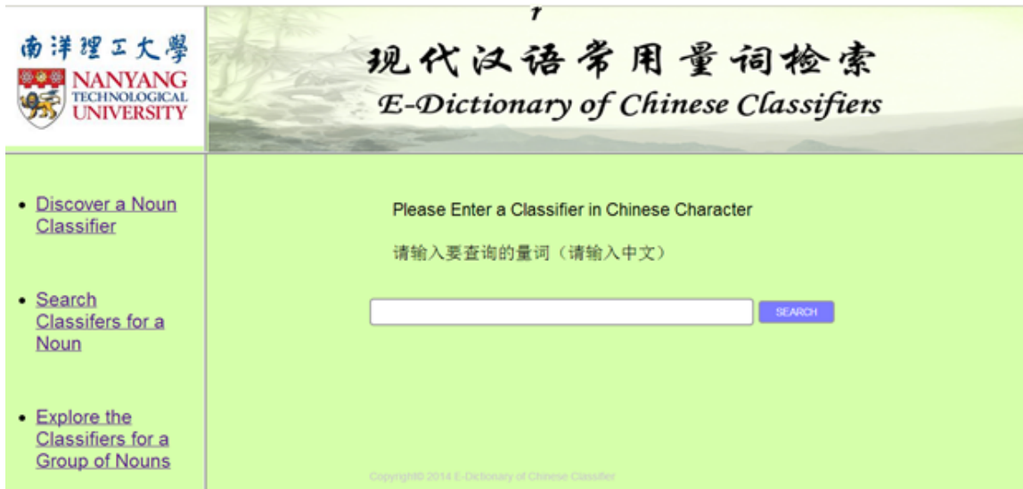
(a) Input page.