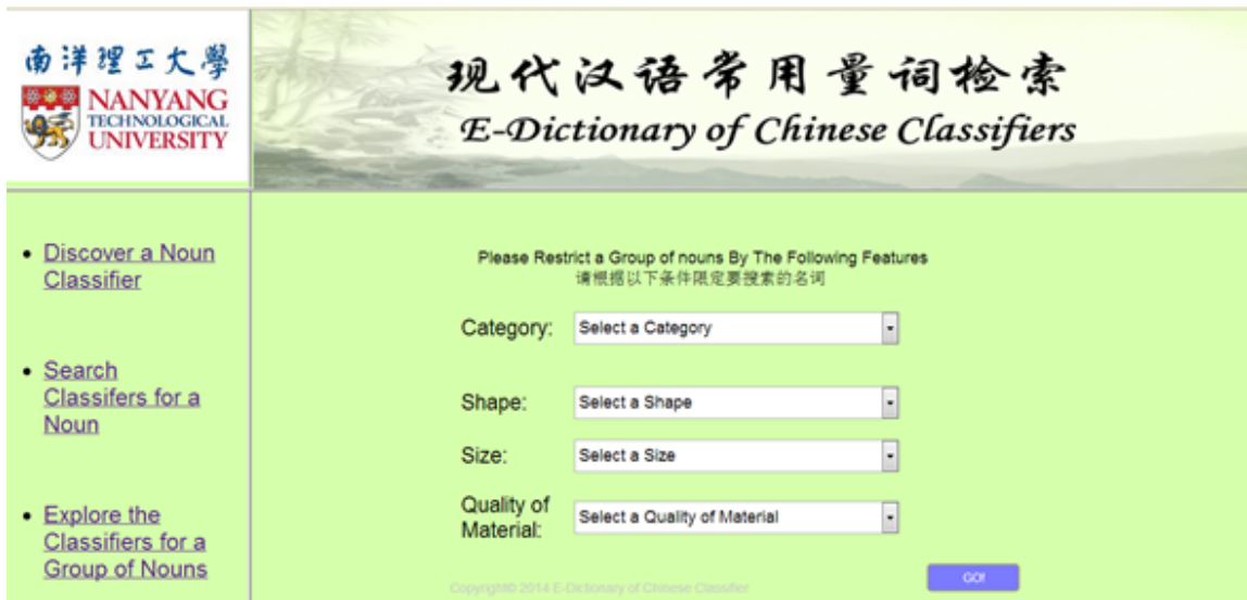
(b) Drop-down list search page.