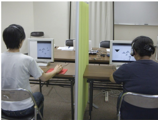
Figure 2: Picture of the experiment setting

As we mentioned in our previous study (Spanger et al., 2009a), this interaction produces frequent use of referring expressions intended to distinguish specific pieces of the puzzle. In our Tangram simulator, all pieces are of the same color, thus color is not useful in identifying a specific piece, i.e. only size and shape are discriminative object-intrinsic attributes. Instead, we can expect other attributes such as spatial relations and deictic reference to be used more often.