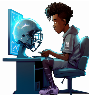
Figure 1: Conversational AI systems are increasingly being integrated into the daily lives of many. While their improved quality is a welcome change, their personalization increases the tendency to anthropomorphize them, which has legal and psychological risks.

Anthropomorphization refers to ascribing human-like traits to non-human entities, and has been used in diverse areas encompassing literature, science, art, and marketing (Ghedini and Bergamasco, 2010; Dunn, 2011; Spatola et al., 2022). It occurs when humans assign emotional or behavioral traits to entities. Several behavioral psychology studies have posited and argued that anthropomorphization is a