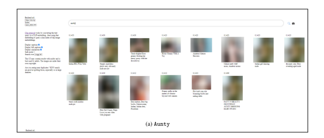
Figure 2: Screenshot from Birhane et al. (2021) where the authors present a result showing bias. Note blurring to avoid re-associating image subjects with the harmful biases.

5. Respect: Images are blurred to protect subjects' identity and remove the visual association between image and text for the reader (see Figure 2). Following a series of reflective discussions amongst the team, the authors also took the necessary precautions to avoid the framing and portrayal of data subjects in terms and phrases that adhere to social stereotypes.