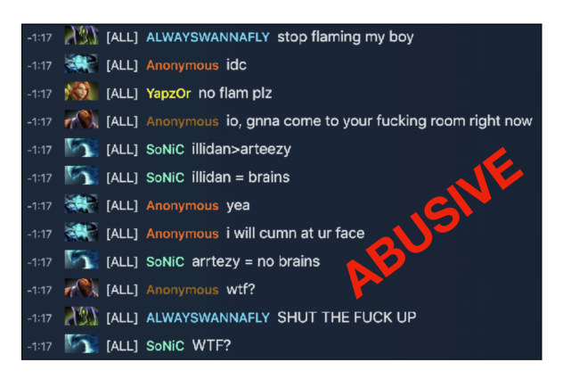
Figure 1: Example of an abusive exchange from an online game.

and autistic spectrum disorders that the vaccine is not connected to these results, and including a reference, so that the message is clear. If possible, the provenance of the content should be identified, provided this is in-line with privacy regulations and ethical concerns; it sometimes may be best to say the platform of origin and date e.g., "From a Twitter user, November 2020".