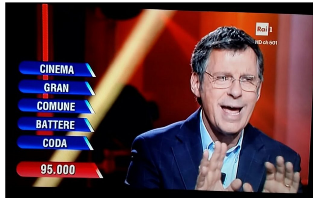
Figure 1: A screenshot of La Ghigliottina . In this case, the solution is cassa : i) cassa del cinema ( cinema box office ), ii) grancassa ( bass drum ), iii) cassa comune ( petty cash ), iv) battere cassa ( beat the check ), and v) coda alla cassa ( checkout line )

with the five clues. The five clues are unrelated to each other, but each is in relation with the solution. In figure 1 we show an example of the game.