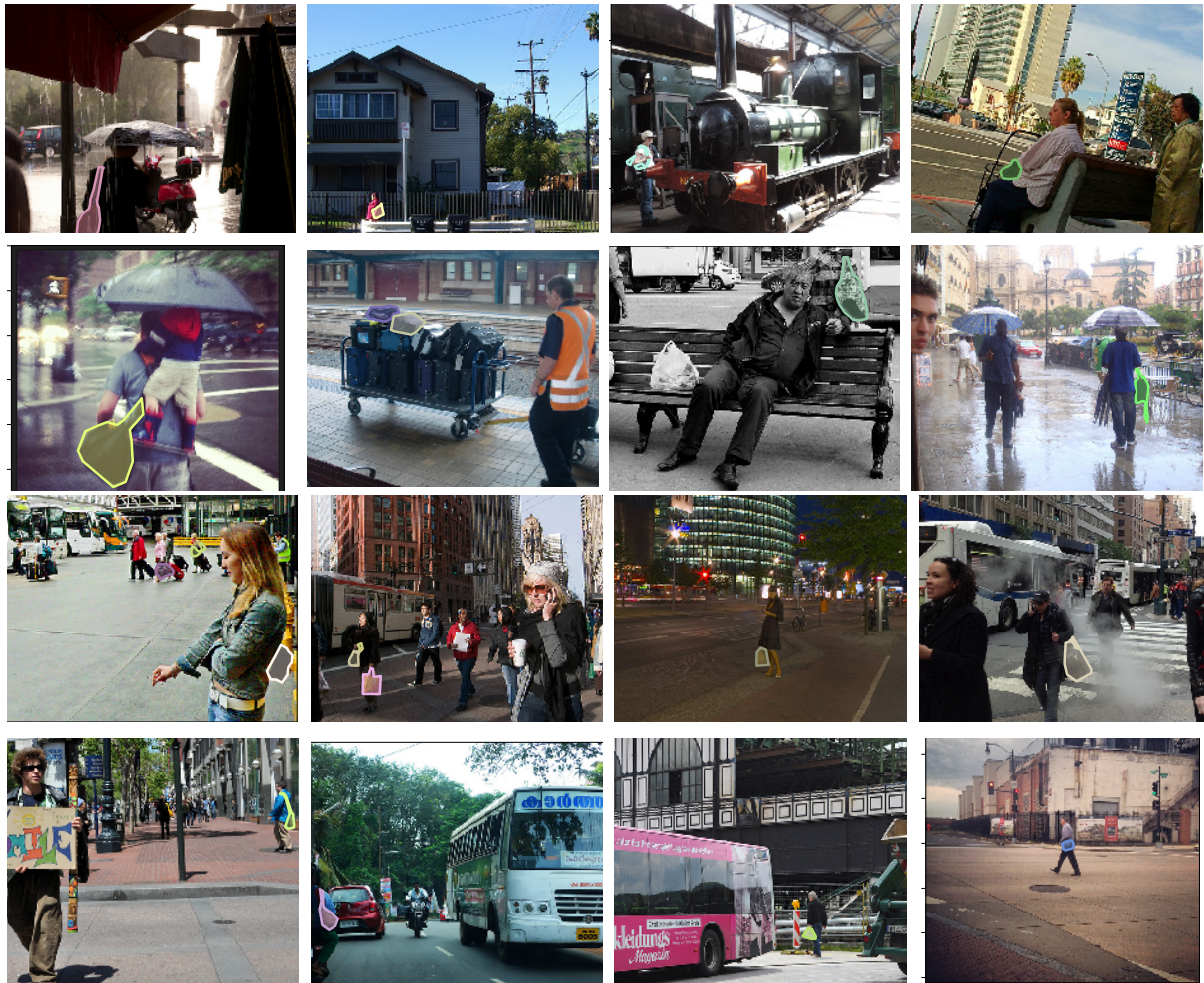
Figure 2: Images selected from least and most biased local groups using LOGAN method. The top 2 and bottom 2 rows stand for the least and most biased clusters respectively. For each group, the first line is from female groups and the second line is from male groups.