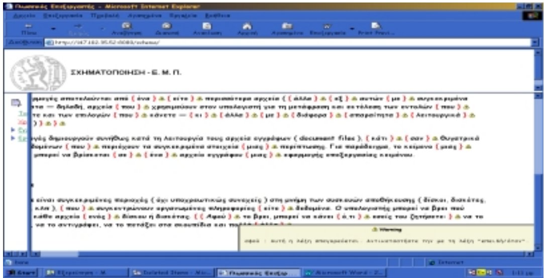
Figure 2. Presentation of the results of the WEB-based authoring tool