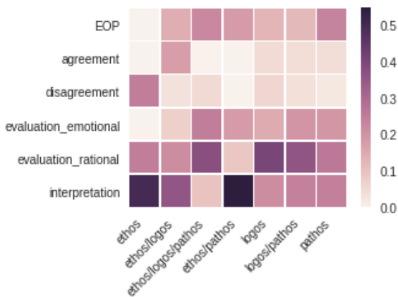
Figure 3: Claim and Premise Heatmap

bution is p < 0.05 , but for the transition matrix the p-value is p = 0.59 , likely due to the very low counts for some cells. However, the value for the claim/premise matrix is p < 0.001 , indicating significant differences even for this small dataset.