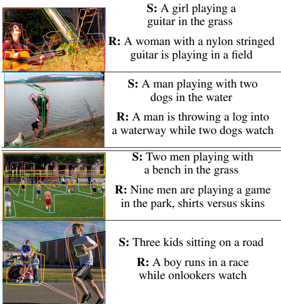
Table 4: Two good examples of output (top), and two examples of poor performance (bottom). Each image has two captions, the system output S and a human reference R .

Human Evaluation Table 2 presents the results of a human evaluation. The full model outperforms all baselines on every measure, but is not always competitive with human descriptions. It performs the best on grammaticality, where it is judged to be as grammatical as humans. However, surprisingly, in many cases it is also often judged equal to the other baselines. Examination of baseline output reveals that the MT baseline often generates short sentences, having little chance of being judged ungrammatical. Furthermore, the Midge baseline, like our system, is a syntax-based system and therefore often produces grammatical sentences. Although our system performs well with respect to the baselines on truthfulness, often the system constructs sentences with incorrect prepositions, an issue that could be improved with better estimates of 3-d position in the image. On truthfulness, the MT baseline is comparable to our system, often being judged equal, because its output is short. Our system’s strength is salience, a factor the baselines do not model.