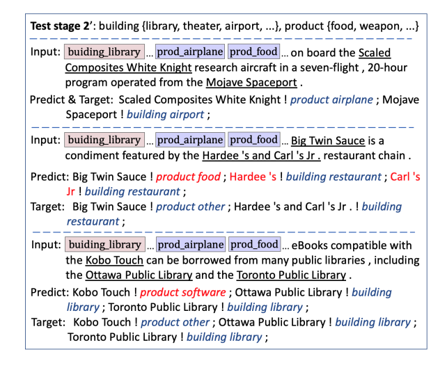
Figure 5: Successful (blue) and failure (red) cases of MODULARPROMPT predictions for stage-fused NER