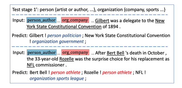
Figure 3: Successful (blue) and failure (red) cases of MODULARPROMPT predictions for stage-fused NER

Apart from achieving SoTA, does ModularPrompt possess the desirable characteristics of a modular model? According to Algorithm 1, ModularPrompt set S=\Omega_i^{ts} during inference. We ex-