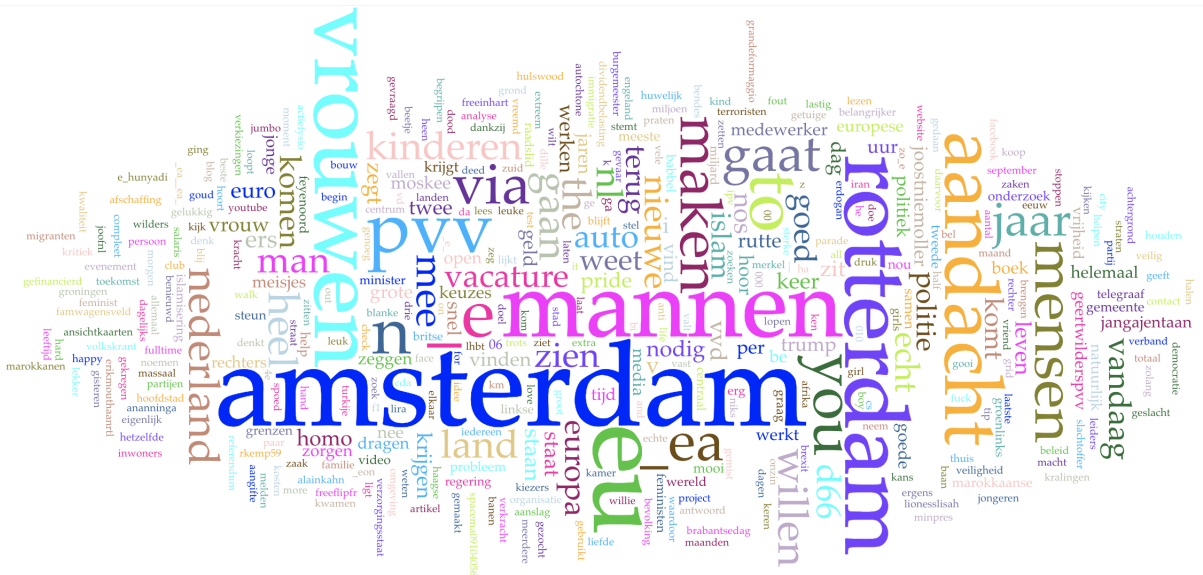
Figure 3: Word cloud of filtered dataset (125 words are shown)