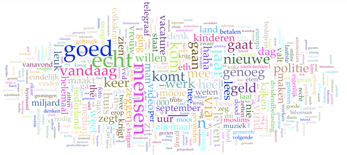
Figure 2: Word cloud of unfiltered dataset (125 words are shown)