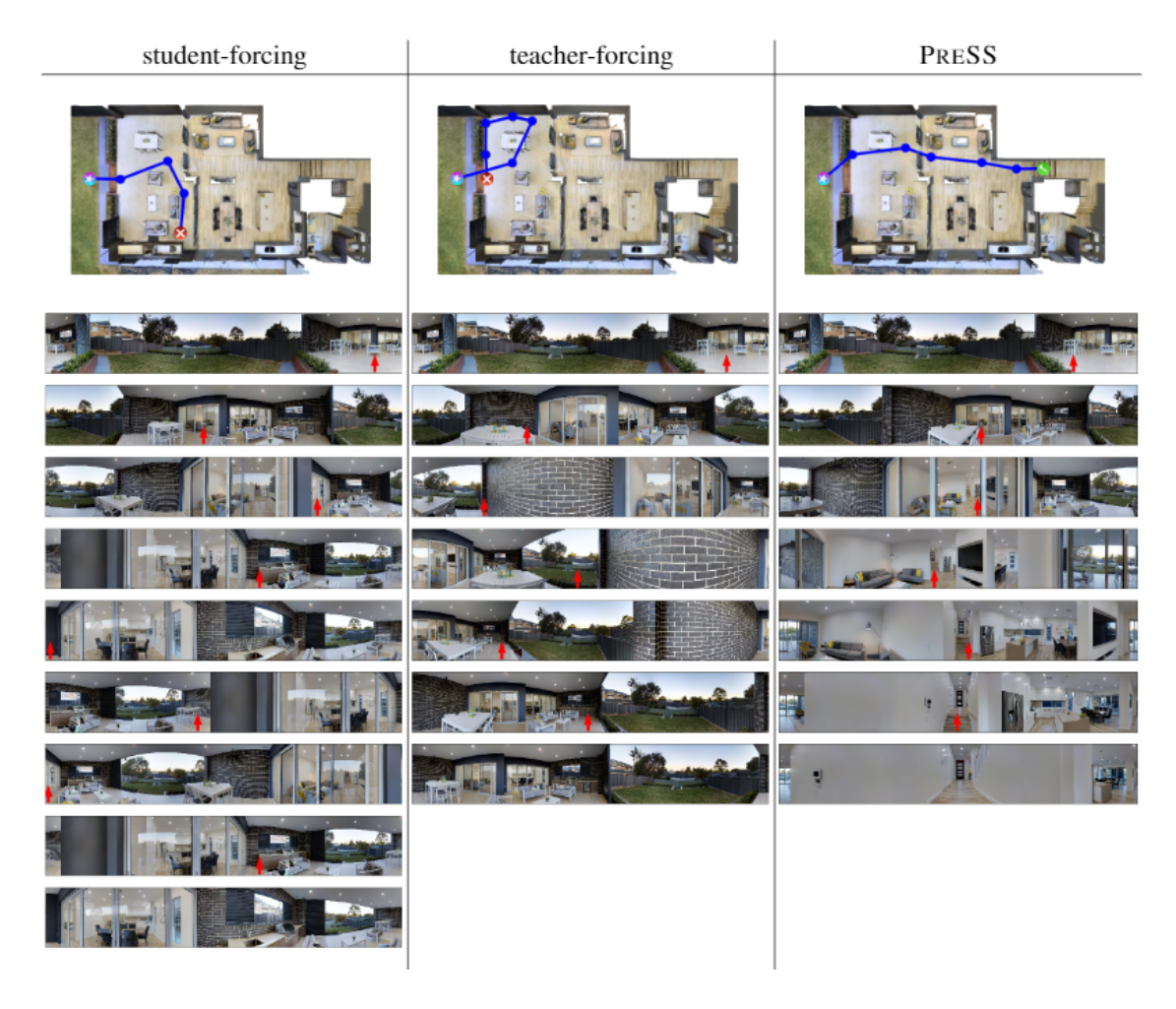
Figure 4: Comparison among the agents trained with teacher-forcing, student-forcing and stochastic sampling strategies on a validation unseen environment (path_id: 7201), including top-down trajectory view and step-by-step navigation views. We indicate the start (?), target (?) and failure (X) of agents in an unseen environment.

Instruction B: Walk up the stairs. Next, walk inside through the sliding glass doors. Continue straight past the television, towards another set of stairs. Wait near the bottom of stairs.