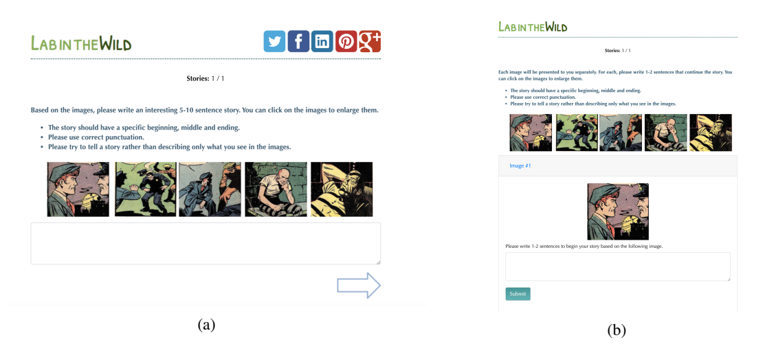
Figure 2: Writing interfaces for the crowdsourcing study using the jail cartoon. (a) is all-at-once interface and (b) is the accordion interface. For (b), participants could see all images at the top, but had to write 1-2 sentences about each image separately though an accordian of text boxes.