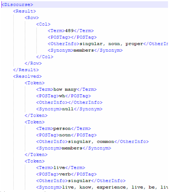
Figure 2. Sample Discourse template.