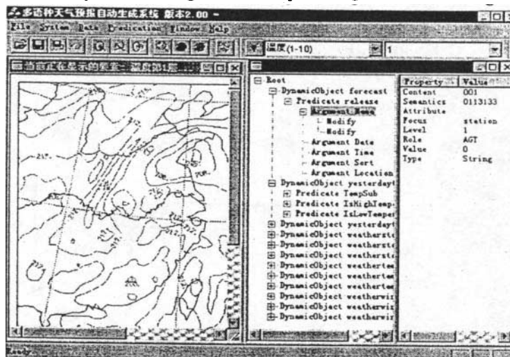
Fig. 2 The Main Window

The main window of the system during the macroplanning is shown in figure 2.