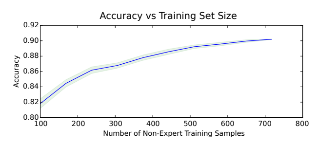
Figure 3: Classifier accuracy by training size. Performance improves with the size of the training set, but begins to level off around 700 samples.

evaluate it against the entire gold standard dataset. Figure 3 below shows the mean and 90% confidence interval for accuracy over 50 random subsamples at each training set size. Performance improves with the size of the training set, but begins to level off when we use all available crowdsourced labels (training set size 717). This suggests that we might achieve only modest improvements in accuracy by gathering further crowdsourced labels.