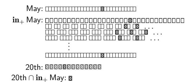
Figure 3: Constructing the XRE for the calendar expression 20 May .

the substring operation: in_+ May. The resulting set is then intersected with the set 20th representing any 20th days of a month, yielding exactly those periods of any May that correspond to a 20th day of the month: 20th \cap in_+ May.