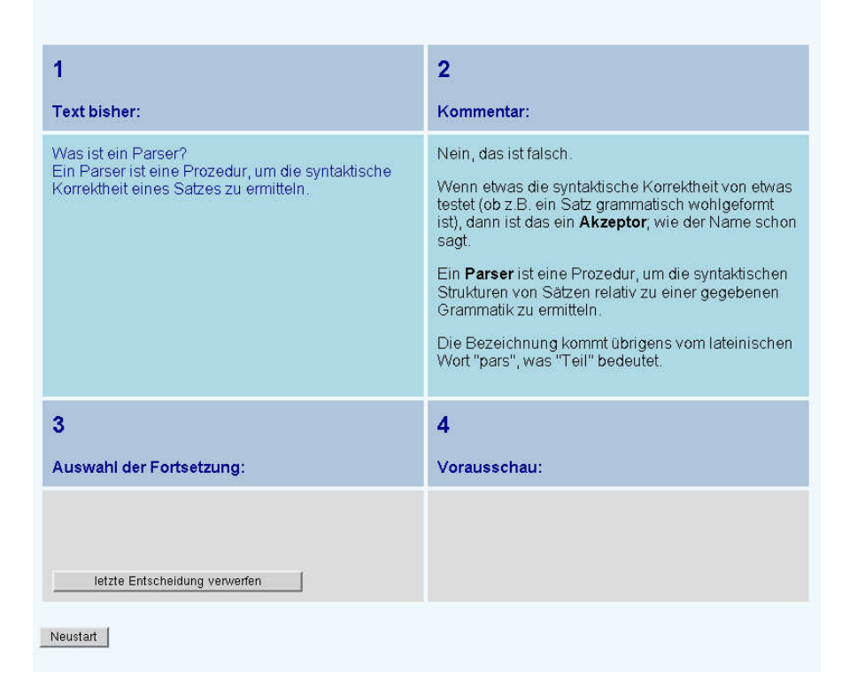
Figure 3: Snapshot of the finished SET session for answering the SET "What is a parser?"

a potentially infinite number). It would be clearly impossible to write individual comments for each of these answers. We overcome this obstacle by generating comments, semi-automatically in some cases, and fully automatically in others. The semi-automatical creation relies on the fact that each answer fragment can be rated according to its correctness and relevance for a given question. It is relatively easy to attach, to a limited number of "strategically important" answer fragments, comment fragments specifying in what way they are (in)correct and (ir)relevant. We then have SET collect the comment fragments of all answer fragments chosen by the learner, and combine them into complete and syntactically well-formed comments that refer to the individual parts of an answer and point out superfluous, missing, or wrong bits, in any degree of detail desired by the author. We can even generate comments on the basis of arbitrarily complex logical conditions over answer fragments, thus identifying, among others, contradictions in answers. That way we can generate a potentially infinite number of com-