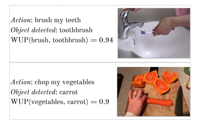
Figure 4: Example of frames, corresponding actions, object detected with YOLO, and the object - word pair with the highest WUP similarity score in each frame.

LSTM and ELMo. We also consider an LSTM model (Hochreiter and Schmidhuber, 1997) that takes as input the tokenized action sequences padded to the length of the longest action. These are passed through a trainable embedding layer,