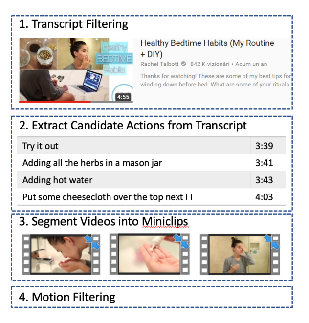
Figure 1: Overview of the data gathering pipeline.

We give each AMT turker a HIT consisting of five minicips with up to seven actions generated