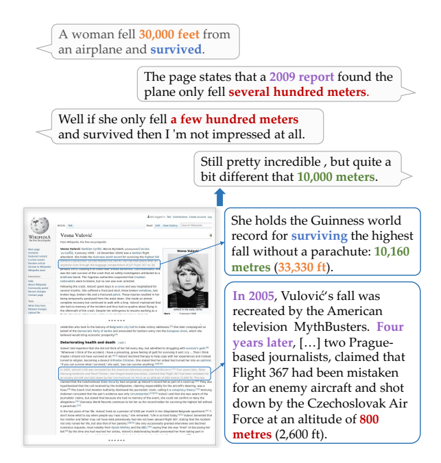
Figure 1: Users discussing a topic defined by a Wikipedia article. In this real-world example from our Reddit dataset, information needed to ground responses is distributed throughout the source document.

While end-to-end neural conversation models (Shang et al., 2015; Sordoni et al., 2015; Vinyals and Le, 2015; Serban et al., 2016; Li et al., 2016a; Gao et al., 2019a, etc.) are effective in learning how to be fluent, their responses are often vacuous and uninformative. A primary challenge thus lies in modeling what to say to make the conversation contentful. Several recent approaches have attempted to address this difficulty by conditioning the language decoder on external information sources, such as knowledge bases (Agarwal et al., 2018; Liu et al., 2018a), review posts (Ghazvininejad et al., 2018; Moghe et al., 2018), and even images (Das et al., 2017; Mostafazadeh et al., 2017).