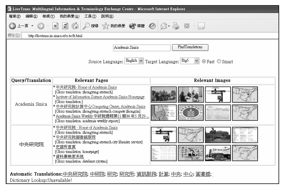
Figure 3. An example showing the search results retrieved by the LiveTrans system, where the given query was "Academia Sinica" and its translations extracted were 中央 研究院, 中研院.

of cases where Chinese users need English-Chinese cross-language translation. In fact, the LiveTrans system was found to be effective in increasing the recall rate of Web search, especially for the retrieval of Web images. Requests for images often are not limited to the local environment. For example, for the original query 羅浮宮 (Louvre) in Chinese, it could retrieve only hundreds of Web images, but it could retrieve hundreds of thousands images through its English translation.