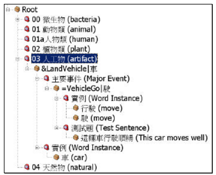
Figure 1 An illustration of the KR-tree using "人工物 (artifact)" as an example noun-sense subclass. (The English words in parentheses are there for explanatory purposes only.)

A knowledge representation tree (KR-tree) of NVEF sense-pairs is shown in Fig.1. There are two types of nodes in the KR-tree, namely, function nodes and concept nodes. Concept nodes refer to words and features in Hownet. Function nodes are used to define the relationships between their parent and children concept nodes. If a concept node A is the child of another concept node B, then A is a subclass of B. Following this convention, we can omit the function node "subclass" (which should exist) between A and B. We can classify the noun-sense class (名詞詞義分類) into 15 subclasses according to their main features. They are "微生物 (bacteria)," "動物類 (animal)," "人物類 (human)," "植物類 (plant)," "人工物 (artifact)," "天然物 (natural)," "事件類 (event)," "精神類 (mental)," "現象類 (phenomena)," "物形類 (shape)," "地點類 (place)," "位置類 (location)," "時間類 (time)," "抽象類 (abstract)" and "數量類 (quantity)." Appendix A gives a sample table of 15 main features of nouns in each noun-sense subclass.