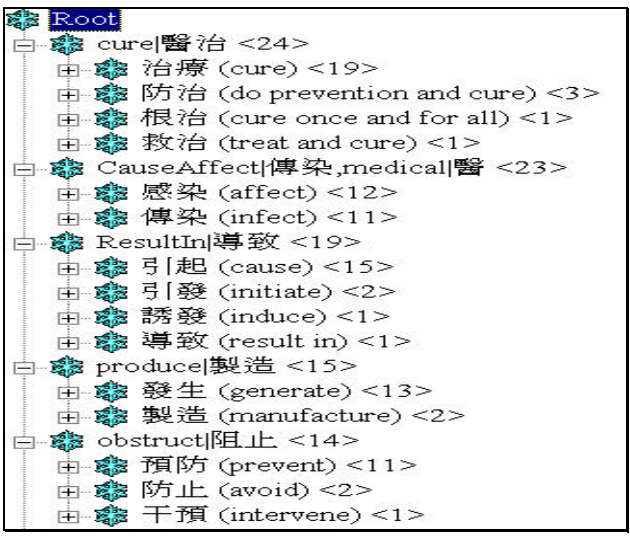
Figure 2 Top 5 possible verb-senses for creating permissible NVEF sense subclasses for the noun-sense "disease|疾病."

Note that among the above steps, only step 5 requires human intervention. This step is quite laborious, but through learning, human involvement can be greatly reduced. Fig. 2 shows the top 5 possible verb-senses picked by the above algorithm for the noun-sense "disease|疾病" collected from 302 sentences in the Sinica corpus. In Fig. 2, the permissible verb-senses for the noun-sense "disease|疾病" are "cure|醫治" with a frequency of 24, "Cause Affect|傳染, medical|醫" with one of 23, "Result In|導致" with one of 19 and "obstruct|阻止" with one of 14. It is observed that, if the number of sentences collected in Step 3 is greater than 300, then the top 5 verb-senses will almost always form NVEF sense-pairs with the selected noun-sense.