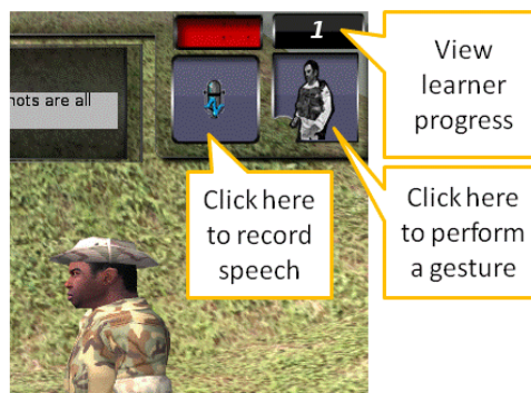
Figure 2. Push the microphone button to speak during a dialog, push again to stop.

The learner must initiate the conversation by speaking into a headset-mounted microphone. He or she clicks on the microphone icon, shown in Figure 3, speaks, then clicks on the icon again to indicate the end of the turn.