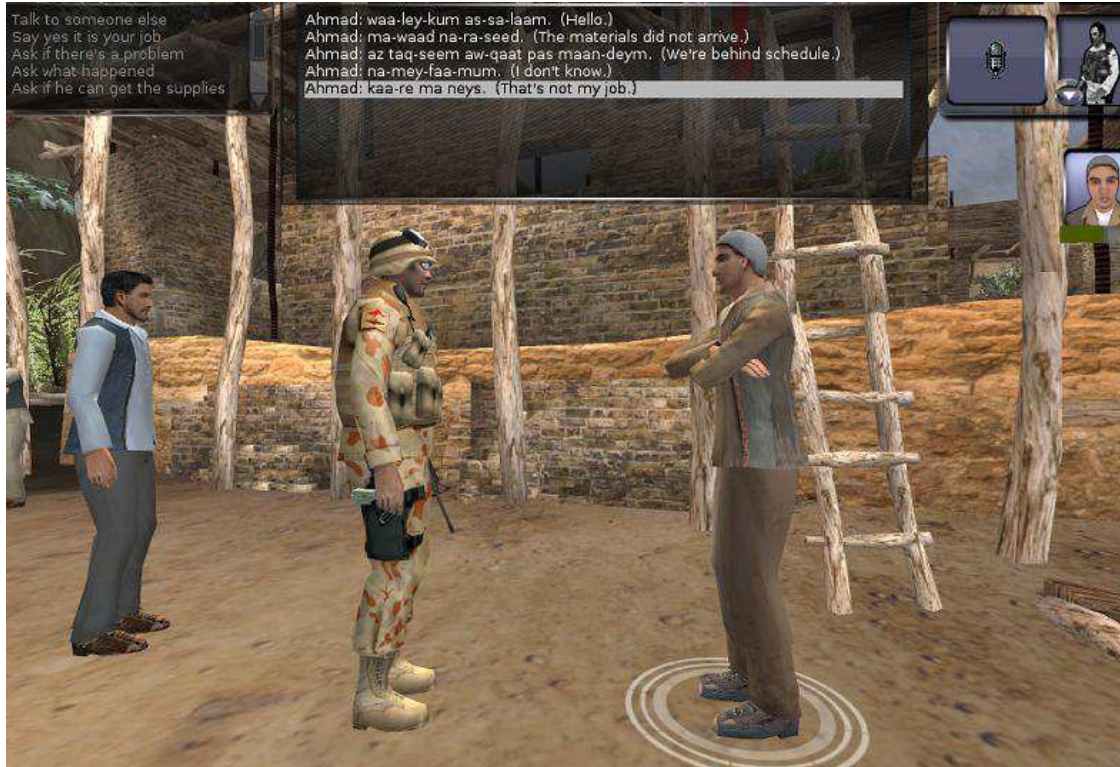
Figure 2. Screen shot of a Mission Game dialog in Operational Dari™