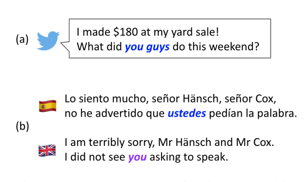
Figure 1: We use two sources for distant-supervision for singular (marked in purple) versus plural (marked in blue) second person pronouns: (a) we find colloquial uses on Twitter, and (b) through alignment with Spanish, which formally distinguishes between the cases.

Ronen Tamari* Hebrew University of Jerusalem ronent@cs.huji.ac.il