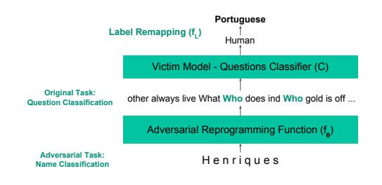
Figure 1: Example of Adversarial Reprogramming for Sequence Classification. We aim to design and train the adversarial reprogramming function f_{\theta} , such that it can be used to repurpose a pre-trained classifier C, for a desired adversarial task.

box scenarios. In the white-box attack scenario, where the adversary has access to the classifier's parameters, a Gumbel-Softmax trick (Jang et al., 2016) is used to train the adversarial program. Assuming a black-box attack scenario, where the adversary may not have access to the classifier's parameters, we present a REINFORCE (Williams, 1992) based optimization algorithm to train the adversarial program.