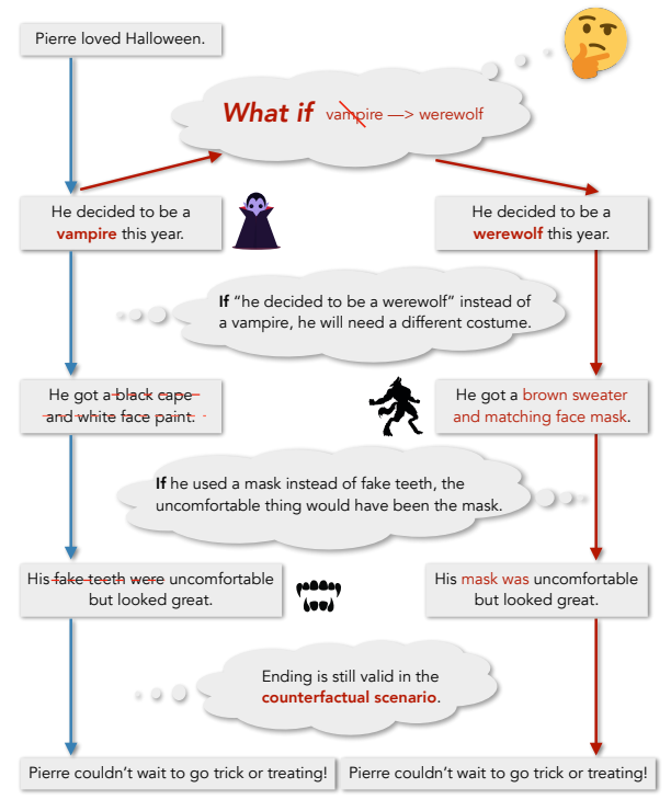
Figure 1: Given a short story (left column) and a counterfactual context ("He decided to be a werewolf this year"), the task is to revise the original story with minimal edits to be consistent with both the original premise ("Pierre loved Halloween") and the new counterfactual situation. The modified parts in the new story (right column) are highlighted in red.

A desired property of AI systems is counterfactual reasoning: the ability to predict causal changes in future events given a counterfactual condition