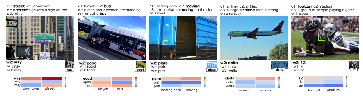
Figure 2: Examples of candidate re-ranking using object (c1), place (c2), and caption (c3) information. The three left examples are re-ranked based on the semantic relatedness score. The delta-airliner relation which frequently co-occurs in training data is captured by the overlap layers . The 12-football pair shows a relatedness between sports and numbers.

cific points in the sequence when computing its output. However, in this case, the attention attends the wrong context, as there are many words have no correlation or do not correspond to actual words. On the other hand, USE-T seems to require a shorter hypothesis list to get top performance when the right word is in the hypothesis list.