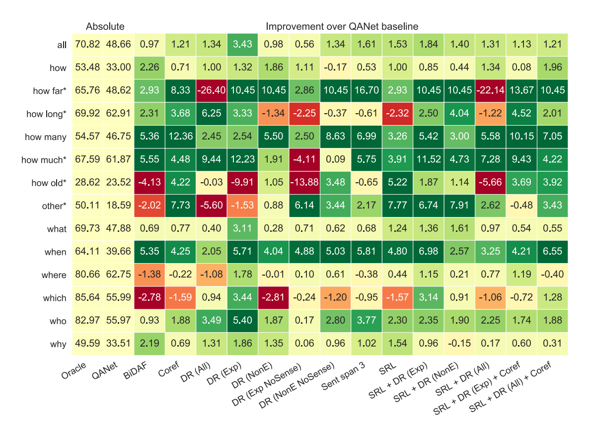
Figure 4: Rouge-L performance per Question Type on the NarrativeQA Test set. The first two columns represent Absolute values. The rest are improvements over the QANet baseline model (i) by BiDAF and (ii) configurations of QANet with linguistic information. Question types with * have less than 100 instances in the Test set.

has the highest Rouge-L. In contrast, using Oracle (Ours), described in Section 4, we report a +11 Rouge-L score improvement (Table 1: This work). The Oracle performance in this setting is important since the produced annotations are used for training of the span-prediction systems, and is considered upper-bound.<sup>3</sup> Seq2Seq (no context) is an encoder-decoder RNN model trained only on the question. ASR is a version of the Attention Sum Reader (Kadlec et al., 2016) implemented as a pointer-generator that reads the question and points to words in the context that are contained in the answer. BiDAF is Bi-Directional Attention Flow (Seo et al., 2017) trained either with the Oracle (original) or Oracle (ours). The models from Previous Work are described in Section 5. In the last section of Table 1 we present the results of our experiments (This work). Here, BiDAF and OANet are implementations available in the AllenNLP framework (Gardner et al., 2018). In the last two rows we give the results of QANet extended with the proposed Discourse-Aware Se-