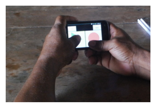
(b) Translating Tembé into Portuguese