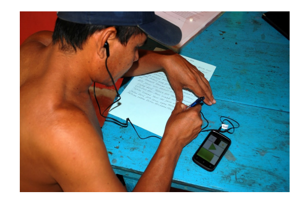
Figure 3: Transcribing a spoken translation

In spite of these problems, there were some successes. The most notable was that participants took no more than a minute to become adept with the recording functionality and the thumb-controlled oral translation functionality (Figure 2b). Second, the availability of multiple networked recording devices meant that we could collect materials in parallel. For example, we could discuss a story we wanted to record and then send several people off at the same time to record their own versions. Then they could synchronise their recordings and hear what each other said. Finally, automatic synchronisation greatly facilitated concurrent transcription activities. We could assign people to transcribe or translate a particular