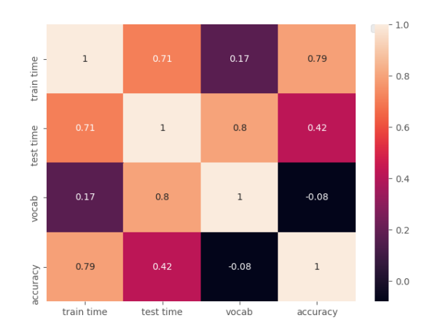
Figure 2: Pearson correlation between the relative performance variables (train time, test time, accuracy, and vocabulary size) from the results of the different preprocessing methods.

cabulary directly leads to faster inference, while which words are removed from the vocabulary has a bigger role in how quickly the algorithm converges during training. This hypothesis is also supported by the low correlation between vocabulary size and accuracy, indicating that what is in the vocabulary is more important than its size.