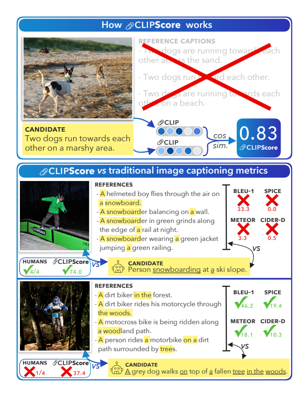
Figure 1: Top: CLIPScore uses CLIP to assess image-caption compatibility without using references, just like humans. Bottom: This frees CLIPScore from the well-known shortcomings of n -gram matching metrics, which disfavor good captions with new words (top) and favor any captions with familiar words (bottom). Attribution: Paperclip, robot icons by Hasanudin, Adiyogi (resp.) from the Noun Project.

For most text generation tasks, reference-based n -gram overlap methods are still the dominant means of automatic evaluation. For image caption generation, recent reference-based metrics have sought to transcend overlap by considering richer models of reference-candidate similarity: e.g., approximate scene graphs (Anderson et al., 2016), allowing reference-based methods to incorporate the image (Jiang et al., 2019; Lee et al., 2020). But, references can be expensive to collect and comparing