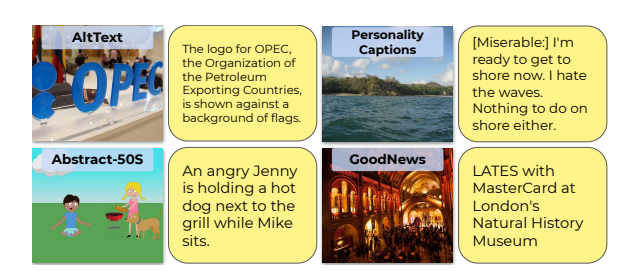
Figure 3: Instances from our four case-study corpora.

When uploading an image alongside a tweet, users of Twitter have the option of providing alterna-