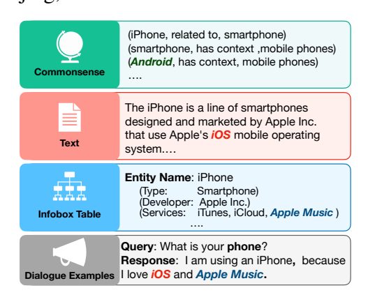
Figure 1: Examples of generating dialogues with multisource heterogeneous knowledge. The number of knowledge sources can exceed one, and the knowledge structure can vary among sources.

hard to be learned from a conversational corpus (Ghazvininejad et al., 2018).