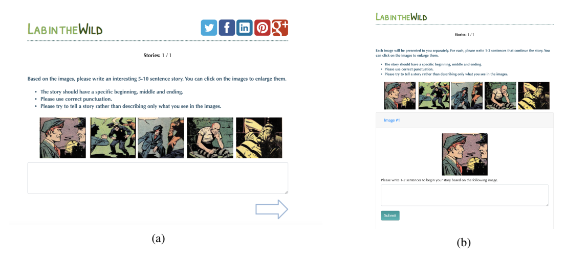
Figure 2: Writing interfaces for the crowdsourcing study using the jail cartoon. (a) is all-at-once interface and (b) is the accordion interface. For (b), participants could see all images at the top, but had to write 1-2 sentences about each image separately though an accordian of text boxes.

age prompt (as measured by one-way ANOVAs.)