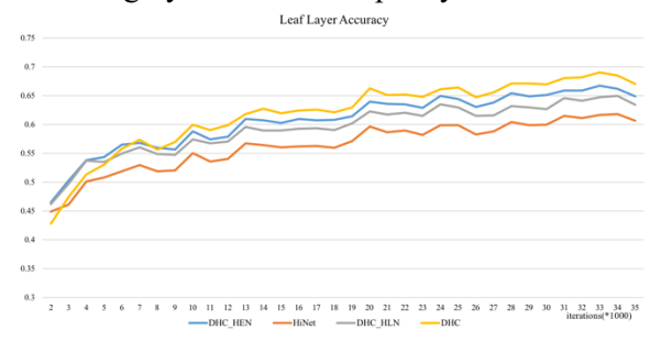
Figure 3. Accuracy evaluation of HiNet, DHC_HEN ( \beta = 0 in Equation 8), DHC_HLN ( R_l = R'_l in Equation 3) and DHC approaches

This set of experiments is to reveal the influence of HEN and HLN. HiNet is adopted as the baseline approach and the experiments are conducted on title-category dataset for simplicity.