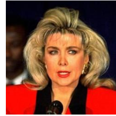
(b) Female example