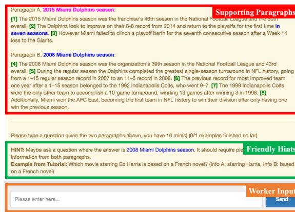
Figure 4: Screenshot of our worker interface on Amazon Mechanical Turk.