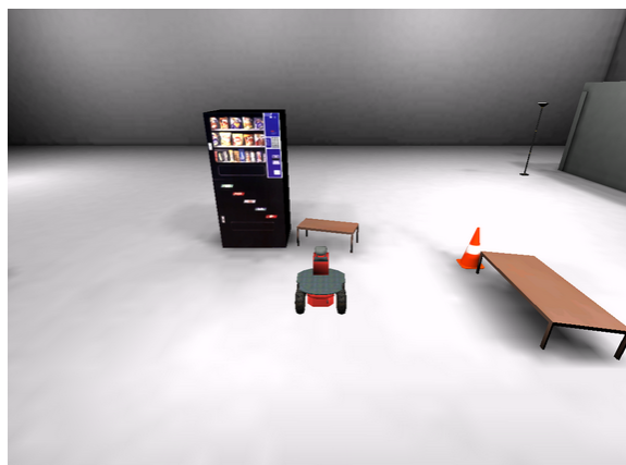
Figure 1: An example trial where the operator’s command was “Move to the table”. In red is the robot ( centered ) pointed toward the back wall. Participants would listen to the operator’s command and enter a response into a text box.

In this study, participants came up with phrases that a search-and-rescue robot should say in response to an operator’s command. The participant’s task was to view scenes in a virtual envi-