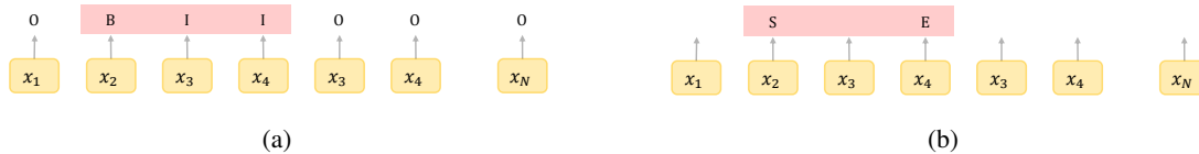
Figure 1: Comparison of SL and SBD, (a) denotes SL, (b) denotes SBD.

training and validation. The task aims to classify comments into three categories: non-aggressive, covertly aggressive, and overly aggressive. The Toxic Comment Classification Challenge 5 2 is an open competition in Kaggle that provides participants with comments from Wikipedia and defines six toxic categories: toxic, severe toxic, obscene, threat, insult, identity hate. In SemEval 2019 task 6 (Zampieri et al., 2019), in addition to whether the comment is offensive, the type of the attack and the target of the attack are also included. Based on this, Semeval 2020 task 12 (Zampieri et al., 2020) further extends the dataset to 5 languages: Arabic, Danish, English, Greek, and Turkish.