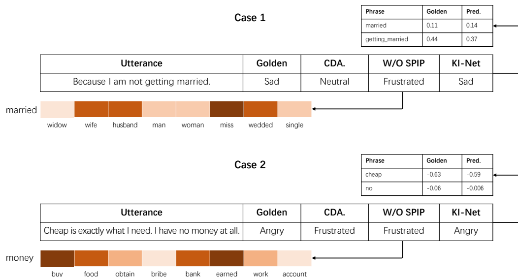
Figure 3: Two cases from the IEMOCAP dataset. Golden, CDA. and w/o SPIP denote the ground-truth label, the prediction of CDA encoder and KI-Net without SPIP. The boxes linked to w/o SPIP and KI-Net denote the attention weights of the top-8 attended concepts of the key token and the polarity_intense prediction results respectively.