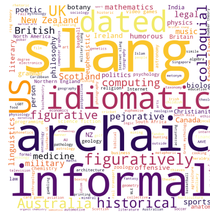
Figure 4: Word cloud of the 300 most common tags in the FEWS senses. For clarity, we manually filter out syntactic and uninformative tags.

This set up also means that all evaluations on FEWS are low-shot (or zero-shot): senses in the few-shot development split have on average 2.06 supporting examples in the training set, with a maximum of 12 examples (these counts increase to 2.13 and 13, respectively, with the extended training data).