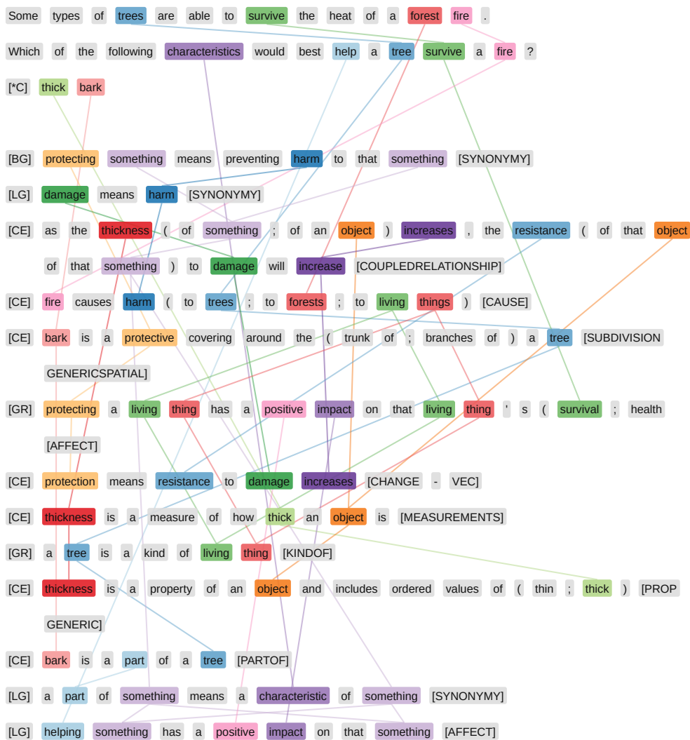
Figure 2: An example of a challenging explanation graph that contains 13 facts, including both core scientific knowledge as well as detailed common-sense or world knowledge.

et al., 2019; Chen and Durrett, 2019). Chen and Durrett (2019) found that simple baseline retrieval models could outperform state-of-the-art multi-hop methods on the HotpotQA dataset. Similarly, Trivedi et al. (2020) found that a large language model can appear to achieve above 70% performance on HotpotQA while only 18% of it’s reasoning truly spans multiple facts. Trivedi et al. (2020) note that this is about the same amount of compositional inference a baseline RNN model, suggesting much of the contemporary performance on some multi-hop inference models may be due to better retrieval modules rather than advancing the science of explicitly combining multiple facts to support inferences.