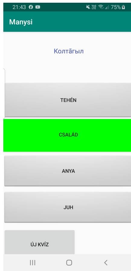
Figure 3: Correct selection of the meaning of the word.

semantic groups of words in the near future.