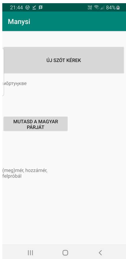
Figure 2: A Mansi–Hungarian entry.

semantic groups of words in the near future.