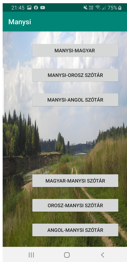
Figure 1: Dictionaries available in apPILcation.