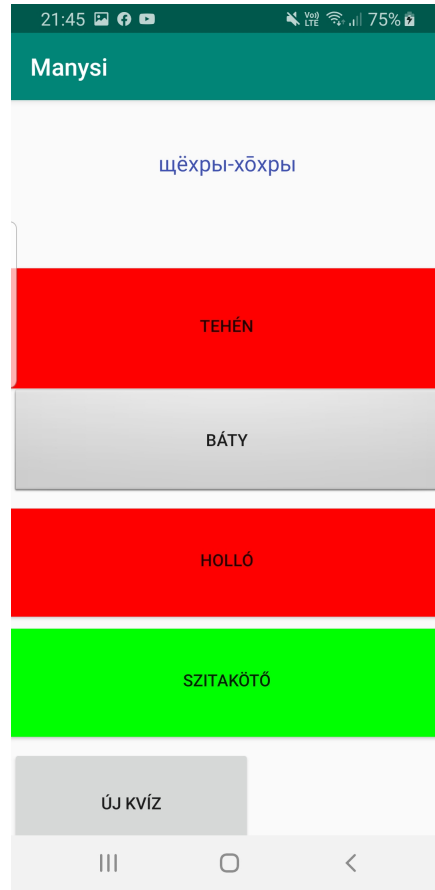
Figure 5: Incorrect, then correct selection of the meaning of the word.