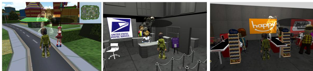
Figure 1: Example screenshots of POMY: path-finding, post office, and market

Considering these requirements, we have developed a conversational English education framework, POMY (POstech iMmersive English studY). The program allows users to exercise their visual and aural senses to receive a full immersion experience to develop into independent English as a Foreign Language (EFL) learners and increase their memory and concentration abilities to a greatest extent [2].