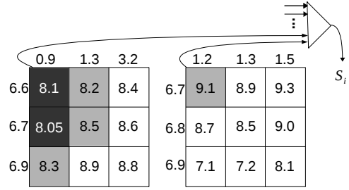
Figure 1: Cubes (grids) are fed to a priority queue (triangle) and generated hypotheses are iteratively popped from the queue and added to stack S_i . Lower scores are better. Scores of rules and hypotheses appear on the top and left side of the grids respectively. Shaded entries are hypotheses in the queue and black ones are popped from the queue and added to S_i .

Each source side non-terminal is instantiated with the legal spans given the input source string, e.g. if there is a Hiero rule \langle aX_1, a'X_1 \rangle and if a only occurs at position 3 in the input then this rule can be applied to span [3, i] for all i, 4 < i \leq n for input of length n and source side X_1 is instantiated to span [4, i] . A worked out example of how the decoder works is shown in Figure 2. Each partial hypothesis h is a 4-tuple (h_t, h_s, h_{cov}, h_c) : consisting of a translation prefix h_t , a (LIFO-ordered) list h_s of uncovered spans, source words coverage set h_{cov} and the hypothesis cost h_c . The initial hypothesis is a null string with just a sentence-initial marker \langle s \rangle and the list h_s containing a span of the whole sentence, [0, n] . The hypotheses are stored in stacks S_0, \dots, S_n , where S_p contains hypotheses covering p source words just like in stack decoding for phrase-based SMT (Koehn et al., 2003).