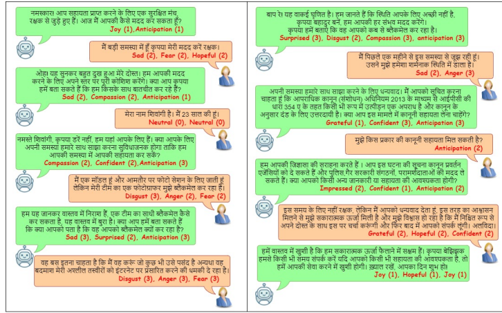
Figure 1: Sample dialogue from our dataset with emotion and corresponding intensity annotation

with the system, thereby strengthening the communication in a positive direction (Martinovsky and Traum, 2006; Prendinger and Ishizuka, 2005). We have annotated every utterance in a dialogue with multiple appropriate emotion categories and their corresponding intensity.