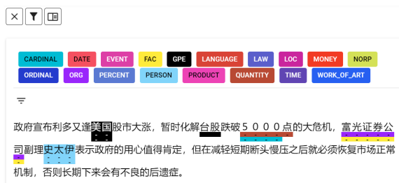
Figure 3: The screenshot of Disagreement Adjudicator.

In summary, the contributions of this paper are