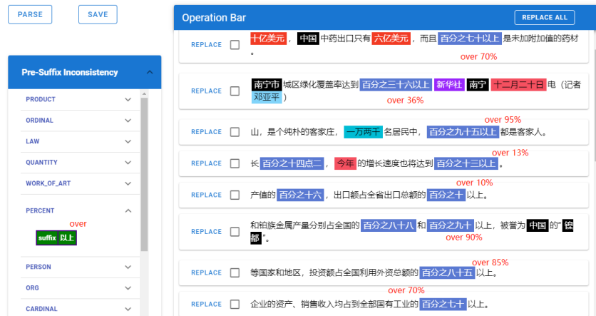
Figure 4: The screenshot of Inconsistency Detector, We provide English translations for inconsistent entities.

suggestions of the annotation result from the perspective of the model.