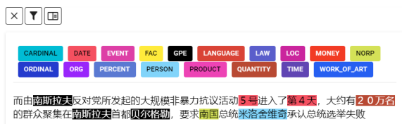
Figure 2: The screenshot of Annotator Interface.

sistency, because this inconsistency occurs in the same instance. Instance-level label inconsistency is easy to locate but difficult to display and correct. YEDDA (Yang et al., 2018) employs a comparison report to show these inconsistencies to annotation experts. But it failed to display detailed information of inconsistent entities, and annotation experts cannot directly correct these entities through the comparison report. To solve these display and correction issues, CroAno uses a multi-dimensional display mode to show inconsistent instances and employs the "click to correct" method to facilitate correction.