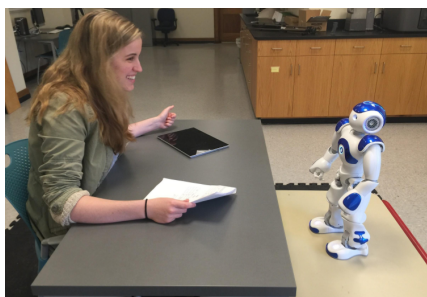
Figure 2: Nico, a teachable robot, being taught by a student.

WOZ experiment overview. Participants were told that their goal was to help Nico solve a set of mathematics problems. Prior to the interaction, they received worked-out problem solutions. During the interaction, a tablet user interface displayed the problem, highlighting one step at time. Nico, controlled by the Wizard, took initiative in leading the dialogue, asking for help about how to approach the problem sub-parts (e.g., “How do I figure out how much paint to mix?”). Participants responded by explaining their reasoning (e.g., “We want to have six cans of green paint so we mix three cans of yellow paint and three cans of blue paint because...”). Nico’s actions included text-to-speech output, gestures such as scratching its head, and updates to values in the tablet interface. Figure 2 shows a student teaching Nico.